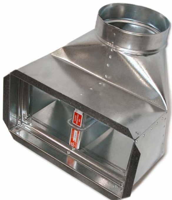
EA "EASY ACCESS" LINK SPRING